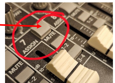
MUTE BUTTON (above)