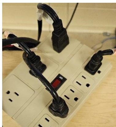
POWER STRIP (above)